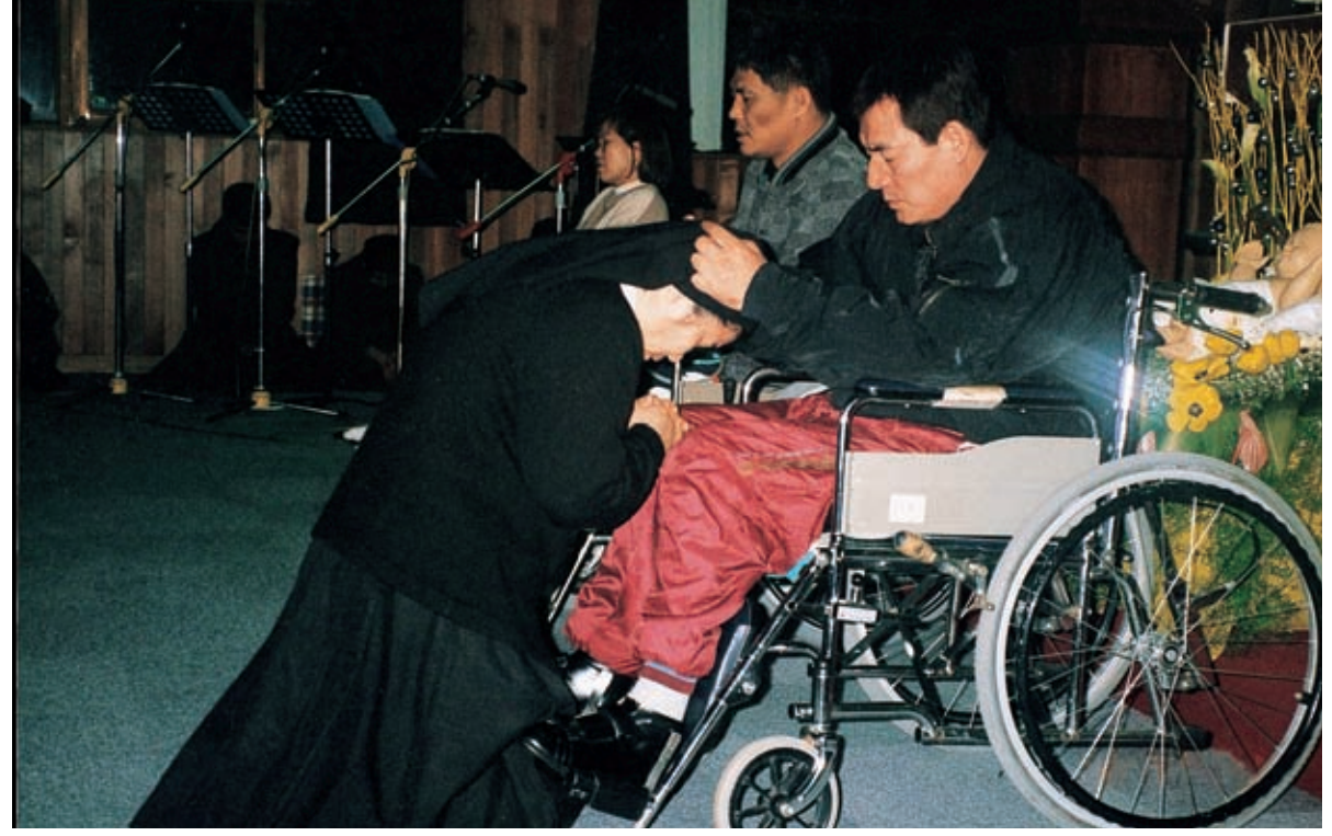
Brothers and Sisters of the community are laying hands on the heads of family members of Kkottongnae during the 8 week seminar of the Holy Spirit. (Top)

Family members of Kkottongnae are laying hands on brothers and sisters.