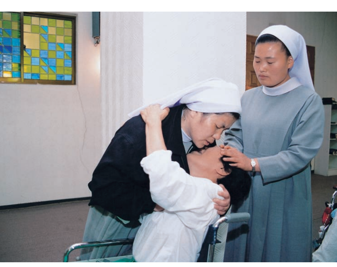
Brothers and Sisters of the Congregation taking part in the 8 week seminar of the Holy Spirit with family members of Kkottongnae.