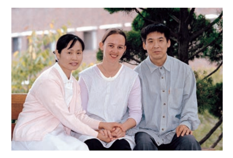
This abandoned person became a family member of Kkottongnae.