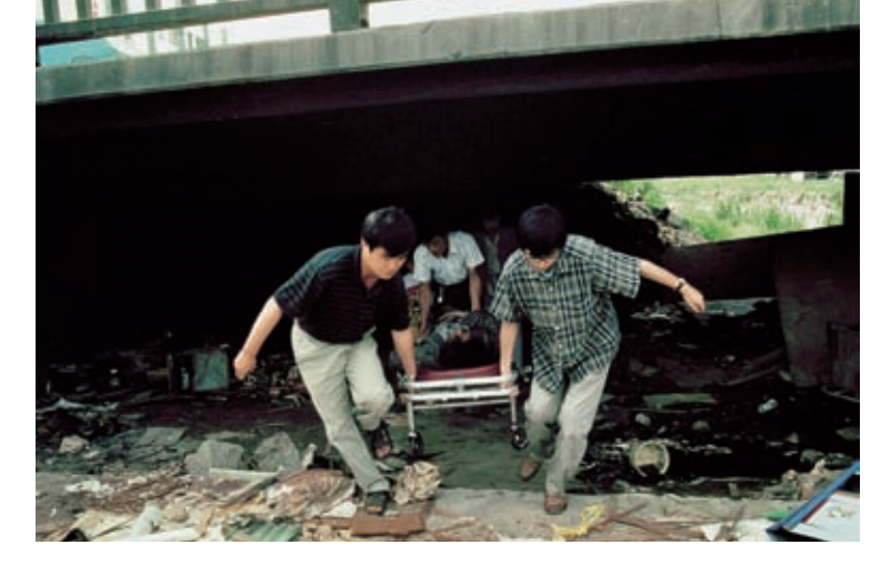
A person with problem of alcohol abuse was found severely burnt and as an emergency was taken to Kkottongnae by some of the brothers.