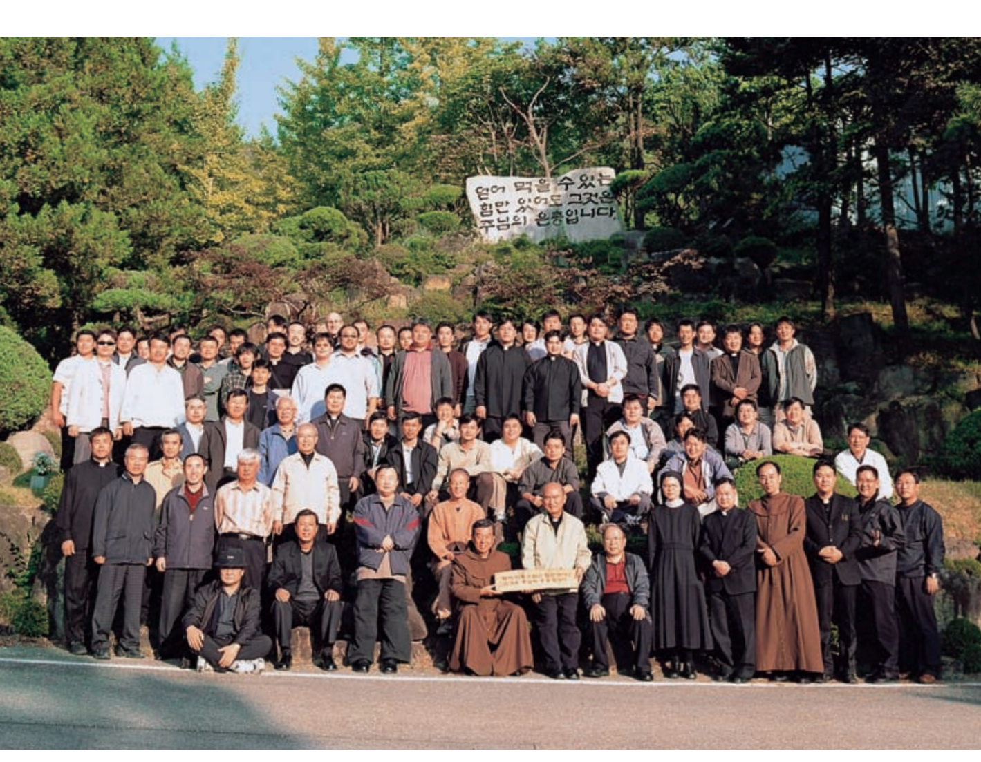
100 priests from diocese of Incheon including Bishop Choi Gui Sun after their visit to Kkottongnae.