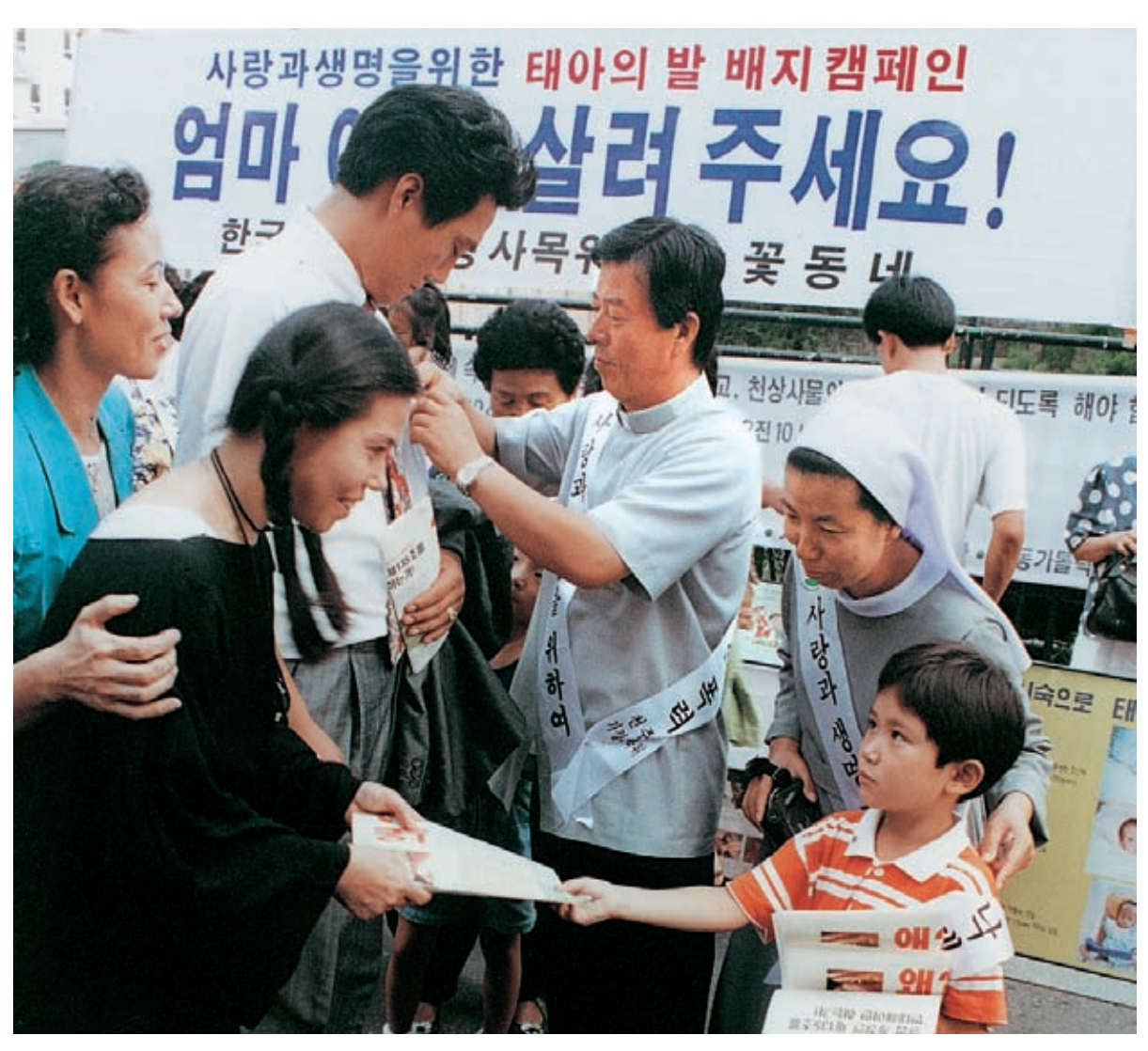
A street demonstration for anti-abortion

It is not easy to follow God's will living in the secular world, since the mundane people sometimes do not feel comfortable with, make fun of, are jealous of, or persecute God's people. The history of Kkottongnae can be expressed as 'the history of flowering God's will in this world by being a tool of the Holy Spirit.' It is the history of spiritual struggle of a priest, who holds the belief that a true priest is a tool of the Holy Spirit who has overcome worldly things.