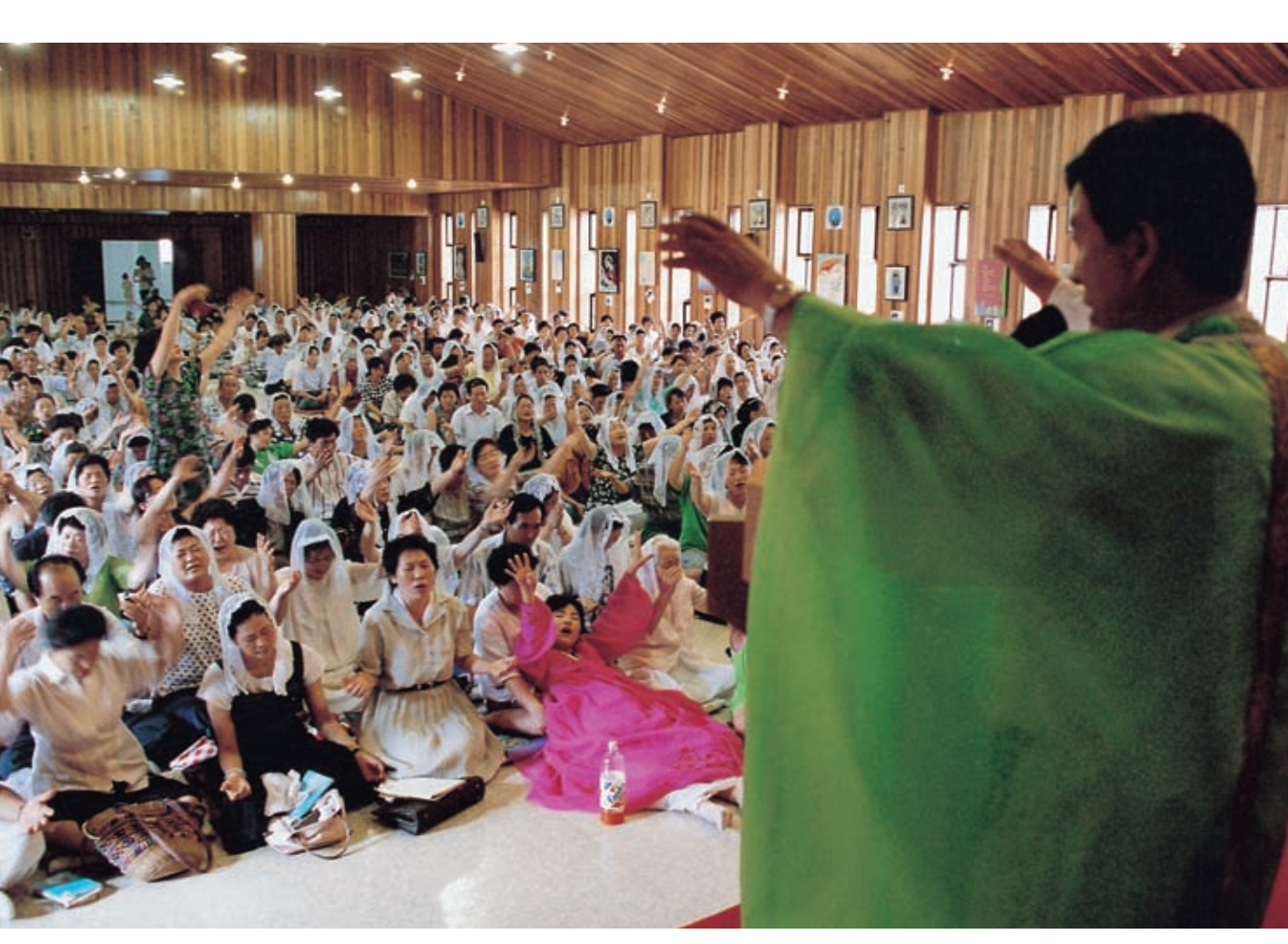
Mass for the Holy Family