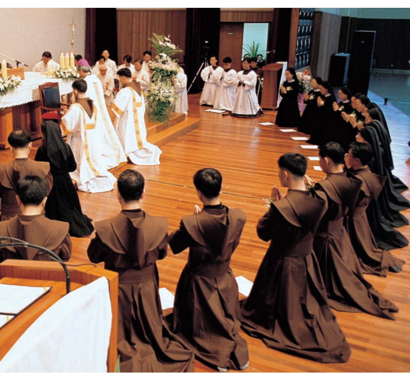
The life vow ceremony of the Brothers and Sisters of Jesus of Kkottongnae

Everybody is returning to their hometown to be with their parents, brothers and sisters, and relatives on the New Year's Day. However, Kkottongnae families do not have a place to go to. The religious at Kkottongnae prepare special holiday food all day long and stay the night with the Kkottongnae families who feel