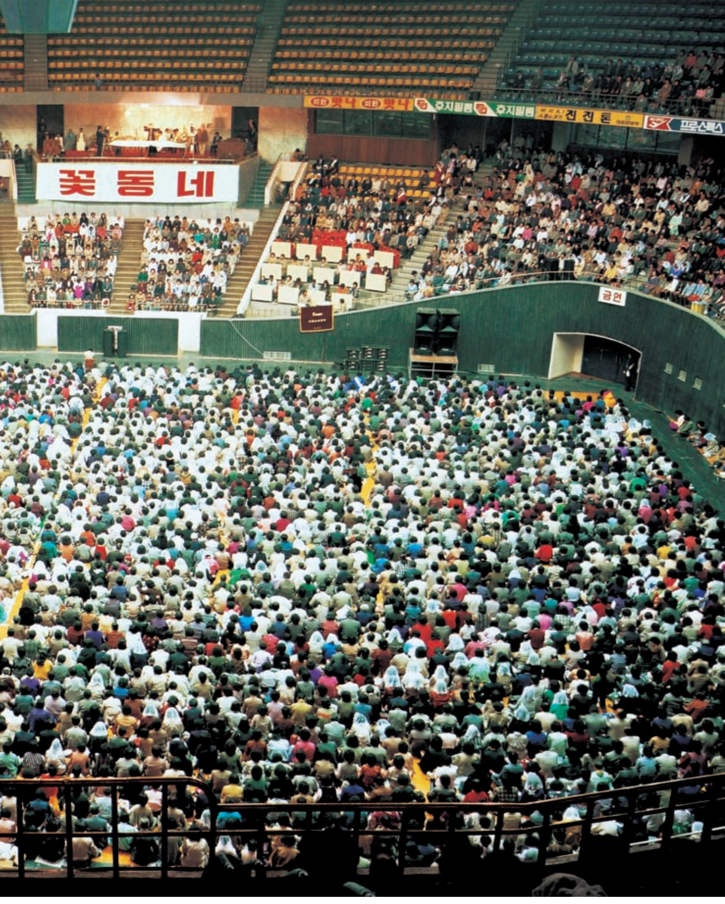
A feature of the gathering for the supporting members of Kkottongnae in a stadium of Jamsil, Seoul