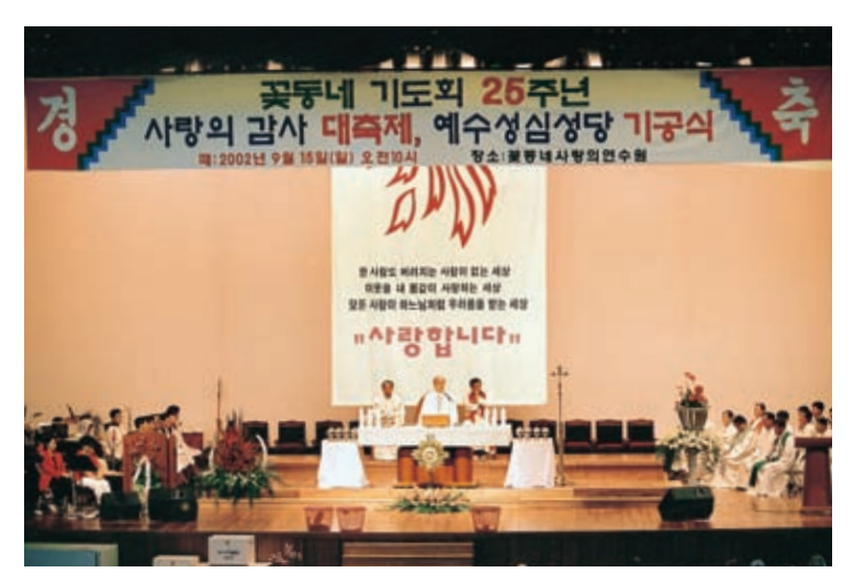
A feature of the 25th anniversary of vigil prayer gathering of Kkottongnae