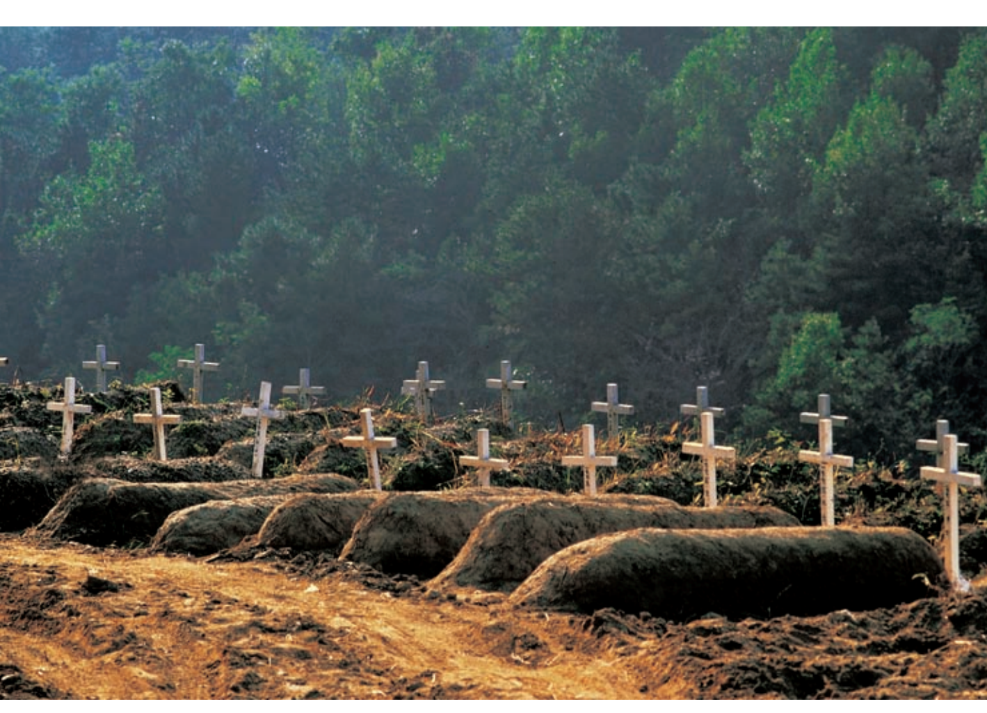
The tombs (referred to as "Paradise") for the people of Kkottongnae in Kkottongnae